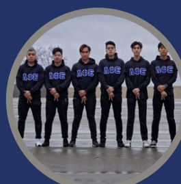
Chapter Charter: George Mason University, Associate Chapter