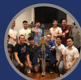
Chapter Charter: The Ohio State University, Associate Chapter