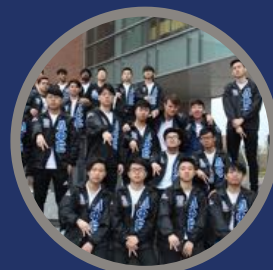
Outstanding Public Relations Program: Rochester Institute of Technology Associate Chapter