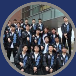
2020 Chapter of the Year: Rochester Institute of Technology, Associate Chapter