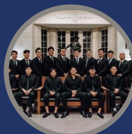
Outstanding Philanthropic Excellence: Alpha Phi Chapter, University of Oklahoma