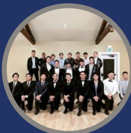
Outstanding Asian Cultural Advocacy: Theta Chapter, Stanford University