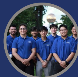
Chapter Charter: University of Tennessee, Knoxville Associate Chapter