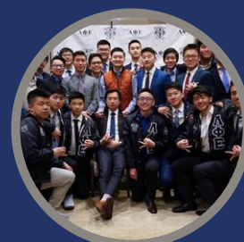
Outstanding Academic Performance: Psi Chapter, University of Chicago