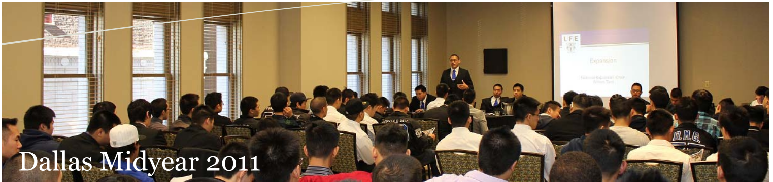
Dallas Midyear 2011