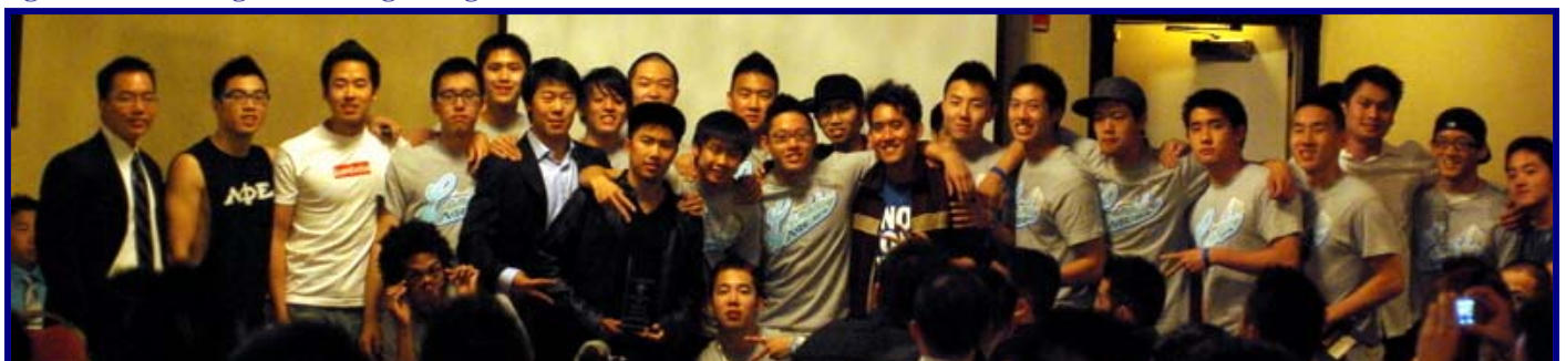
Academic Chapter of the Year: Theta Chapter - Stanford University